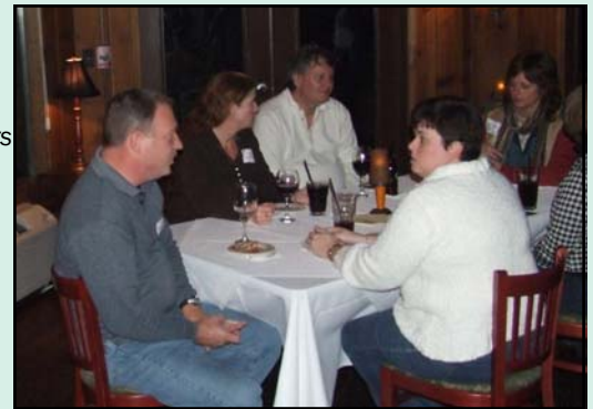
Members enjoy Business After Hours at Crestwood on November 16.