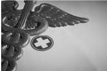
Educate yourself on the new Health Care Bill.