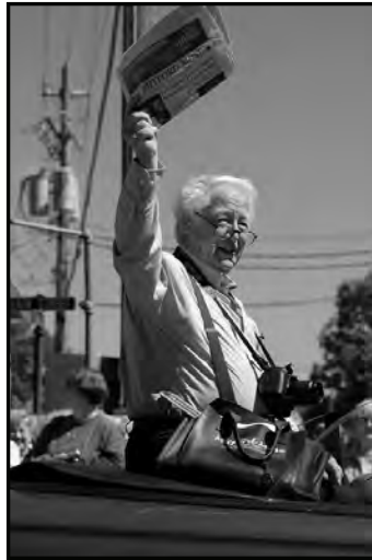
Mitford Days Parade