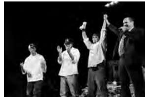
Fan Blue Ridge Wine & Food Festival on Facebook to see more photos.