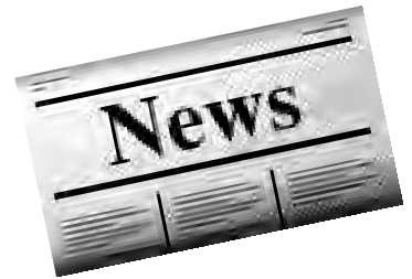
Look at the great stuff our members are up to!

Hear from representatives of the US and NC Departments of Commerce and how they can help NC companies thrive by growing internationally. Find out how to access these agencies. Hear about "Export University." Discover programs available at ASU. The Watauga County Economic Development Commission invites you to attend a Lunch & Learn workshop on international business –Noon, Friday, April 30, 2010 at the Appalachian Enterprise Center – RSVP required – lunch provided! Call 264-2225 or email