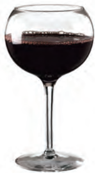
The glass is half full for the North Carolina Wine and Culinary Center at Blowing Rock

prised of representatives from across North Carolina, including Appalachian State University, Johnson & Wales University, the North Carolina Wine & Grape Council and Yadkin Valley Wine Growers Association. The Steering Committee will issue a full report in the late fall. Blowing Rock is fast becoming known as a destination for food and wine, hosting The Blue Ridge Wine And Food Festival and the Fire on the Rock Chef Challenge.